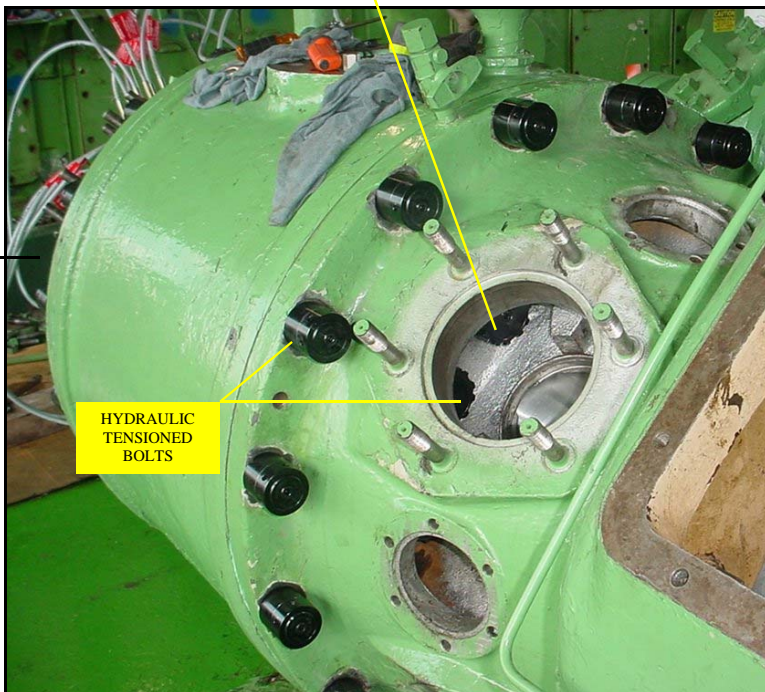
HYDRAULIC TENSIONED BOLTS