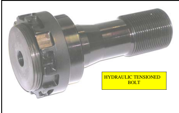
HYDRAULIC TENSIONED BOLT

Tensioning Solutions : Hydraulic Tensioned Bolt